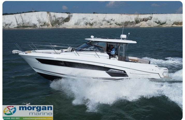
Jeanneau Cap Camarat 12.5 WA - port side