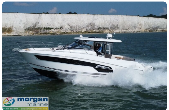
Jeanneau Cap Camarat 12.5 WA - moving through the water