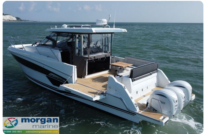
Jeanneau Cap Camarat 12.5 WA - overhead view of cockpit