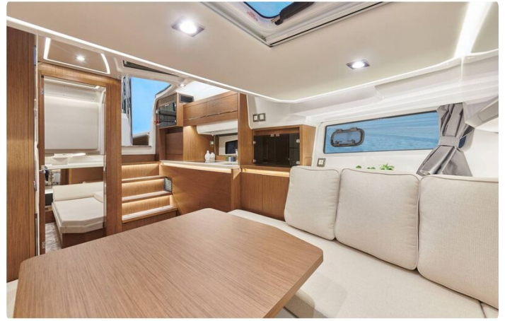
Jeanneau Cap Camarat 12.5 WA - forward cabin / saloon