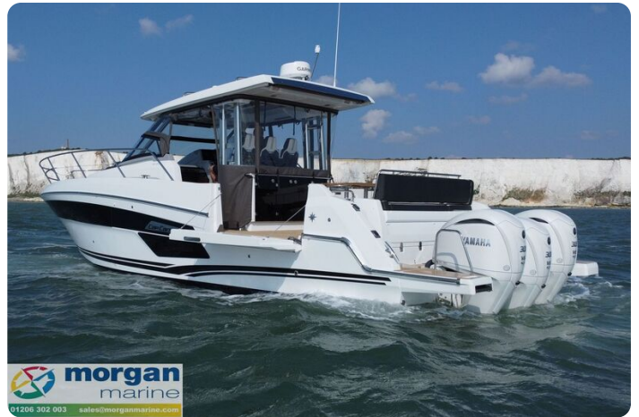
Jeanneau Cap Camarat 12.5 WA - view towards port side terrace and outboards