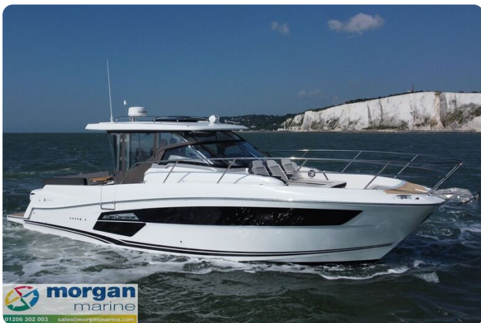
Jeanneau Cap Camarat 12.5 WA - bow from starboard side