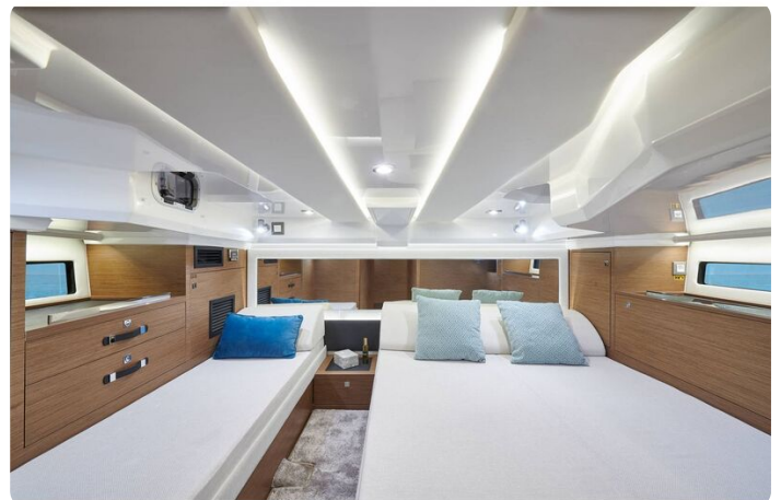
Jeanneau Cap Camarat 12.5 WA - aft cabin