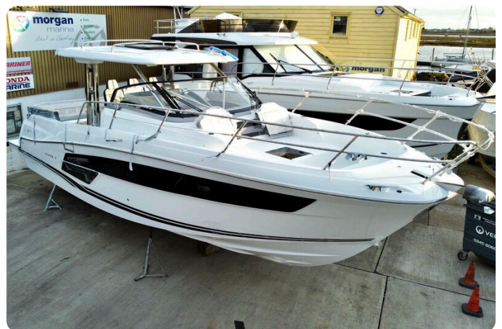
Jeanneau Cap Camarat 12.5 WA in Morgan Marine's yard