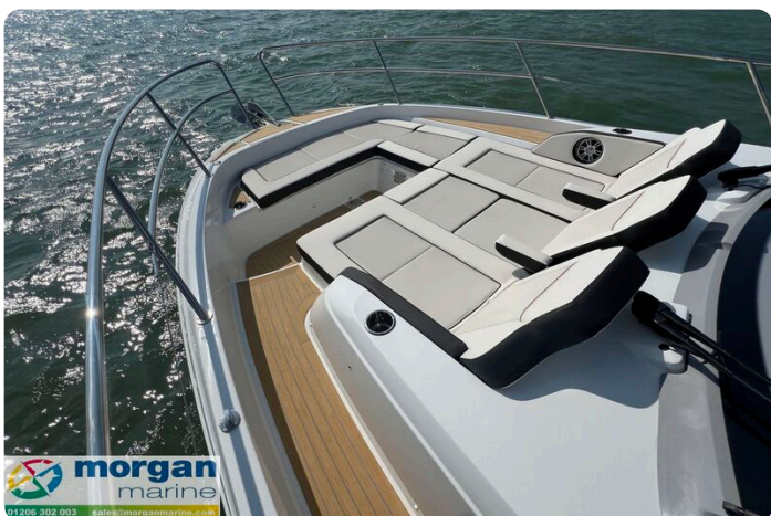
Jeanneau Cap Camarat 12.5 WA - side deck towards bow