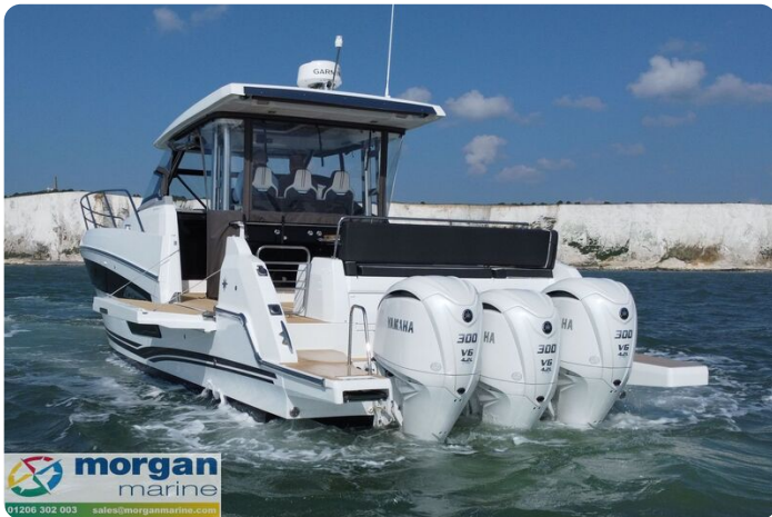
Jeanneau Cap Camarat 12.5 WA - view of transom from port side aft