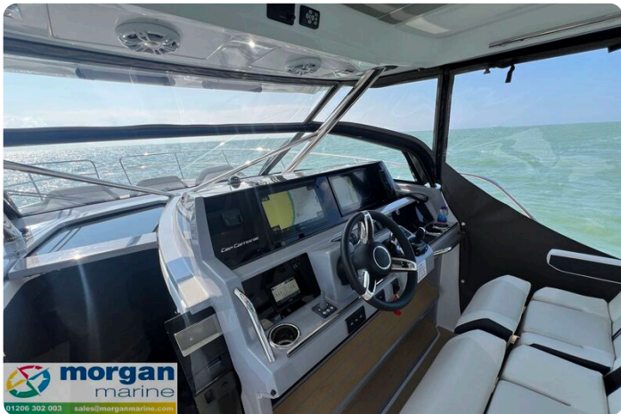
Jeanneau Cap Camarat 12.5 WA - helm position with great visibility