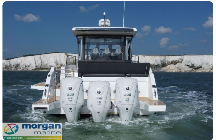
Jeanneau Cap Camarat 12.5 WA - transom with triple Yamaha outboards