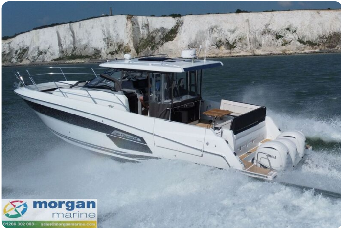
Jeanneau Cap Camarat 12.5 WA - port side aft