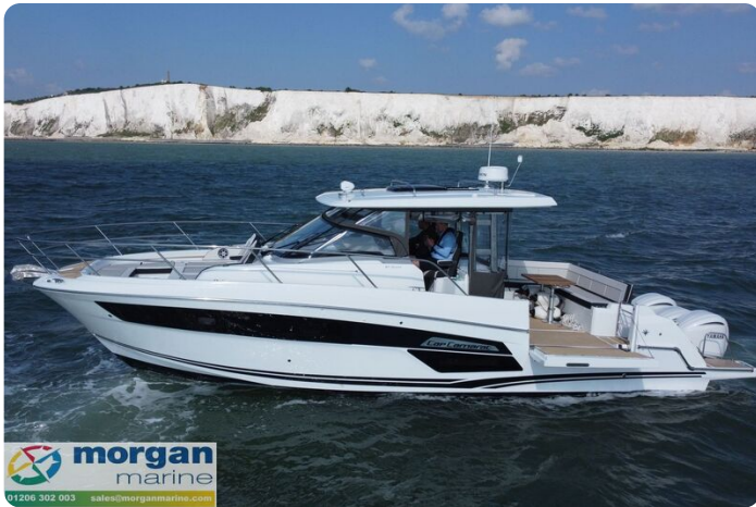
Jeanneau Cap Camarat 12.5 WA - port side view of cockpit and hardtop roof