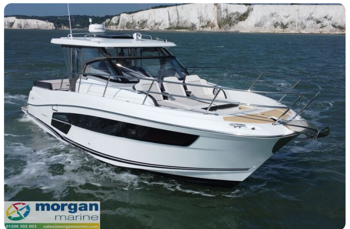
Jeanneau Cap Camarat 12.5 WA - starboard side bow