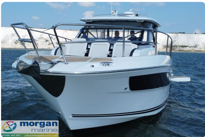
Jeanneau Cap Camarat 12.5 WA - bow seating