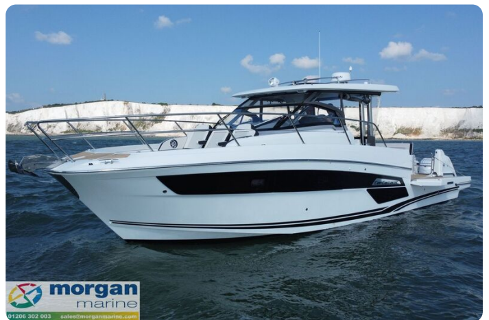
Jeanneau Cap Camarat 12.5 WA - view from bow on the water