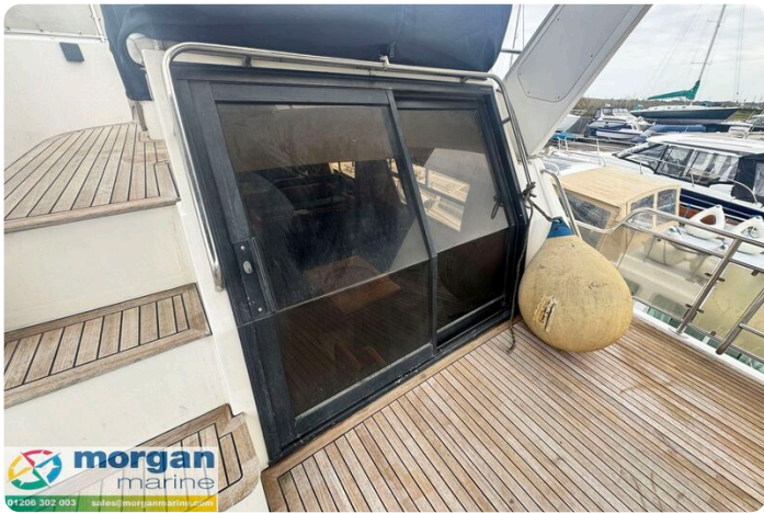
Humber 42 - doors