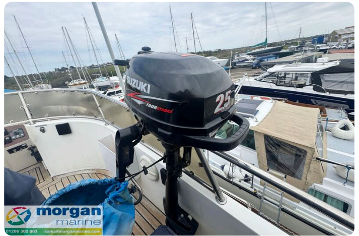
Humber 42 - aux