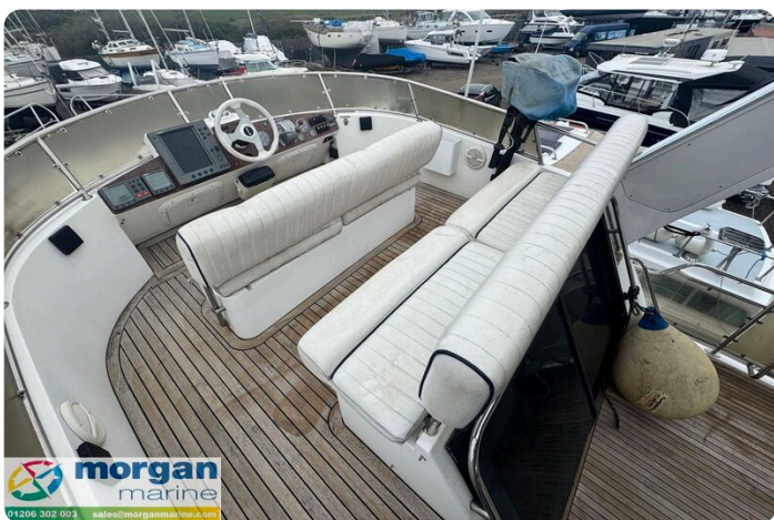
Humber 42 - fly