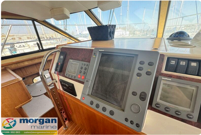
Humber 42 TSDY - plotter