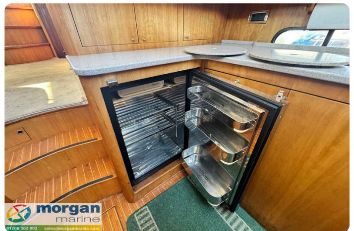
Humber 42 TSDY - fridge