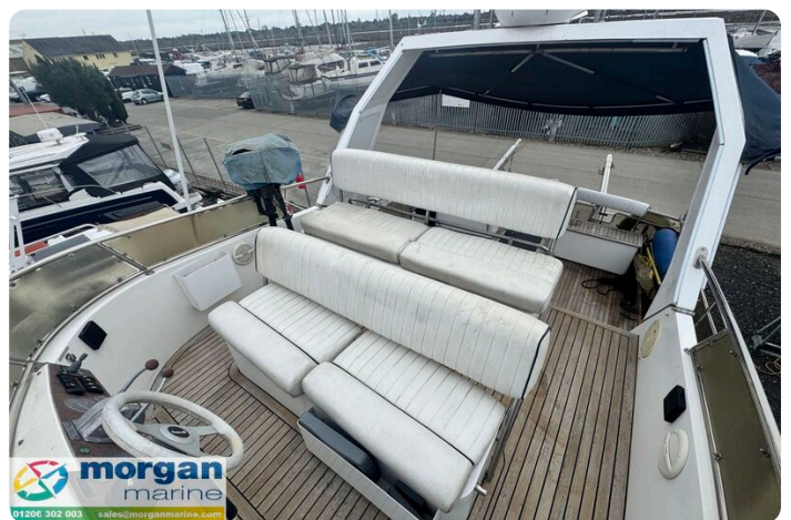
Humber 42 - fly seats