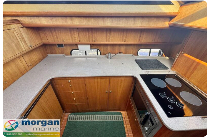
Humber 42 TSDY - galley