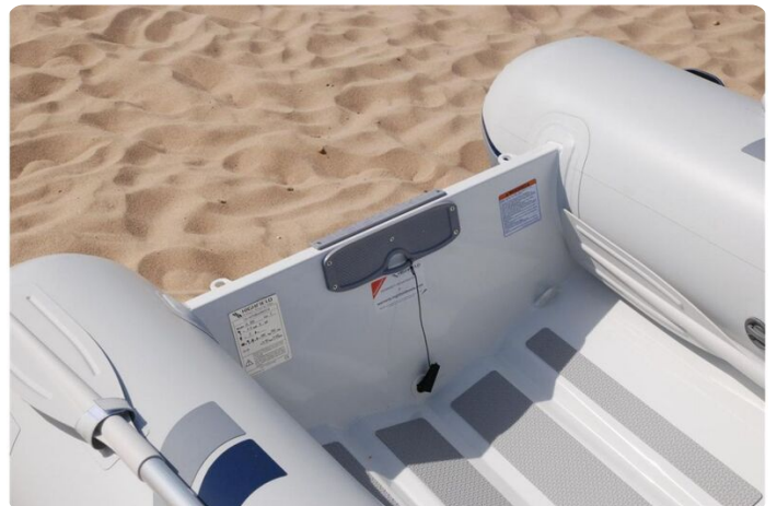
Highfield UL 340 aluminium RIB - deck and transom