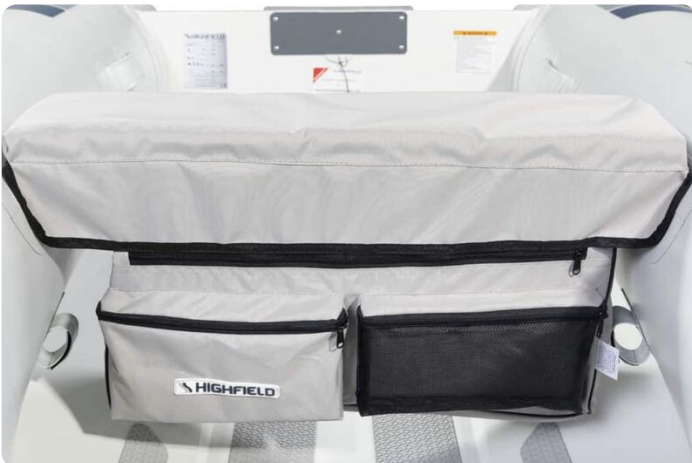
Highfield UL 340 aluminium RIB - storage