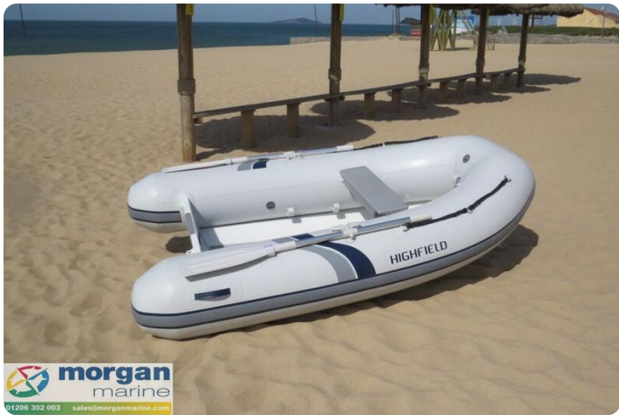
Highfield UL 340 aluminium RIB