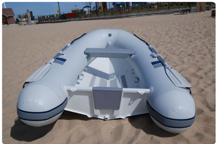
Highfield UL 340 aluminium RIB - overhead view