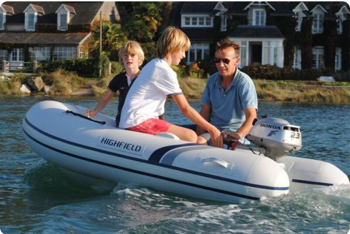
Highfield UL 240 aluminium RIB