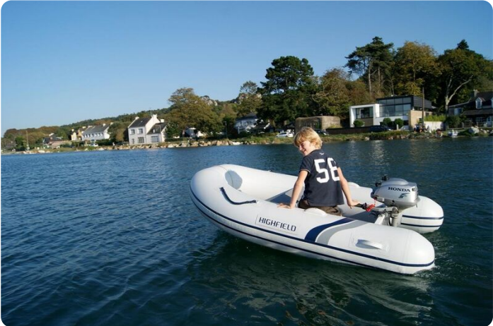
Highfield UL 240 aluminium RIB - on the water