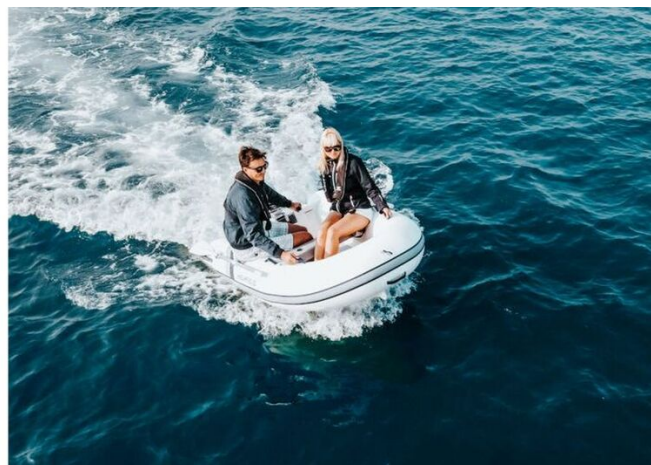
Highfield UL 240 aluminium RIB - moving through the water