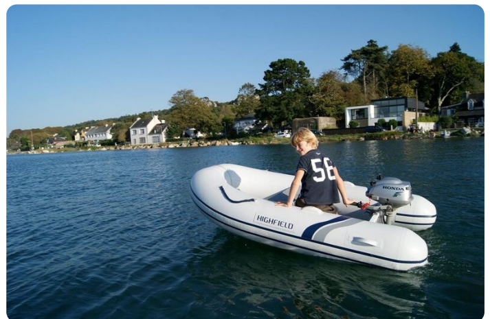
Highfield UL 240 aluminium RIB - on the water