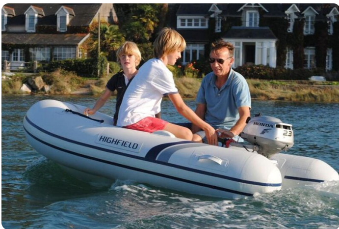
Highfield UL 240 aluminium RIB