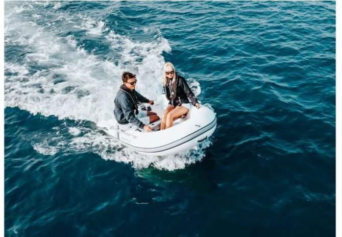
Highfield UL 240 aluminium RIB - moving through the water