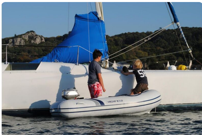
Highfield UL 240 aluminium RIB - next to larger boat