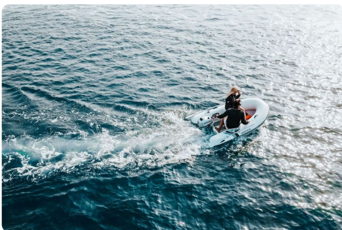
Highfield UL 240 aluminium RIB - overhead view