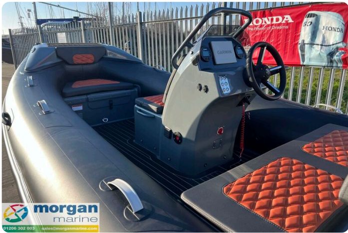
Highfield Sport 420 - handles