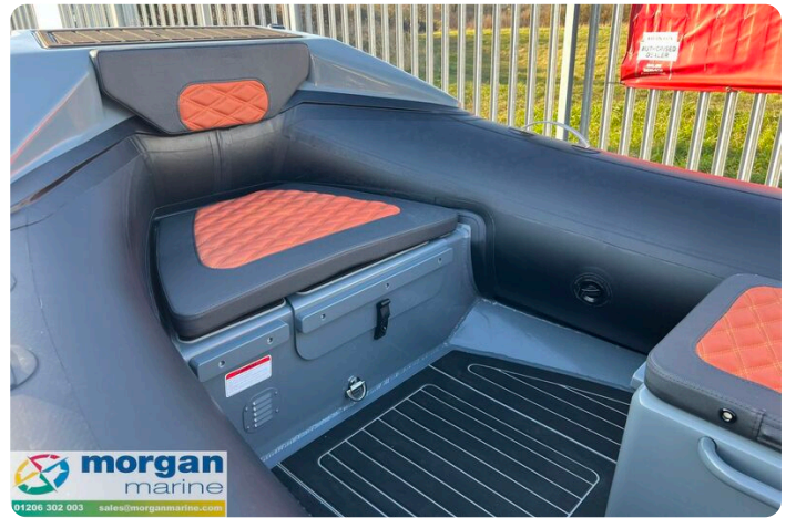
Highfield Sport 420 - bow seat