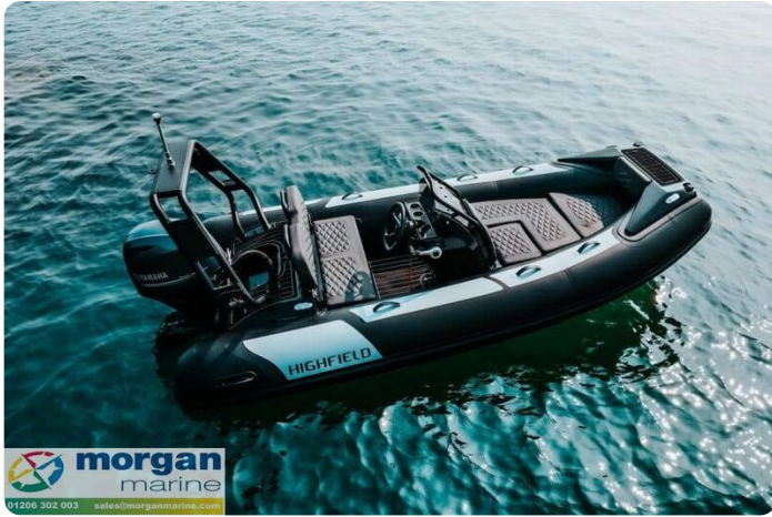
Highfield Sport 390 aluminium RIB