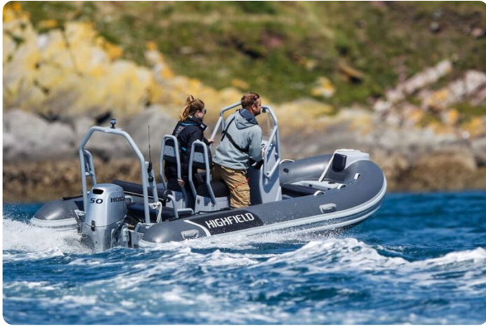
Highfield Classic 460 aluminium RIB