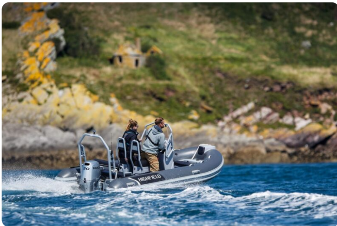
Highfield Classic 460 aluminium RIB