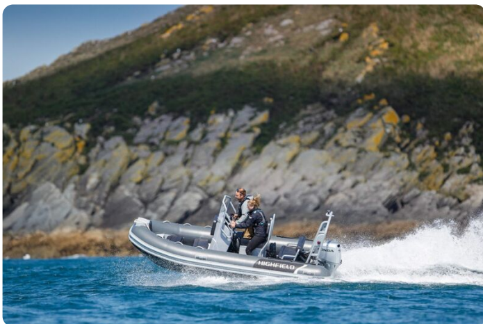
Highfield Classic 460 aluminium RIB - on the water