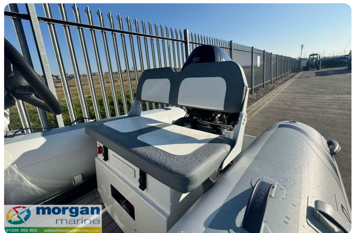
Highfield Classic 380 GT console - seating