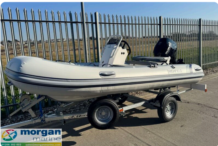
Highfield Classic 380 GT console - side