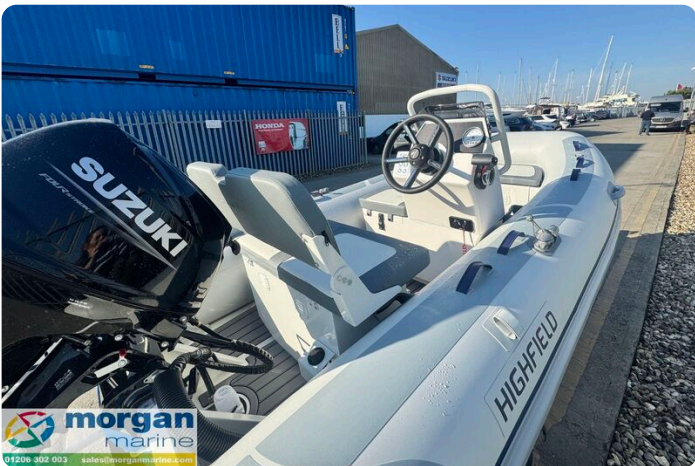
Highfield Classic 380 GT console - back