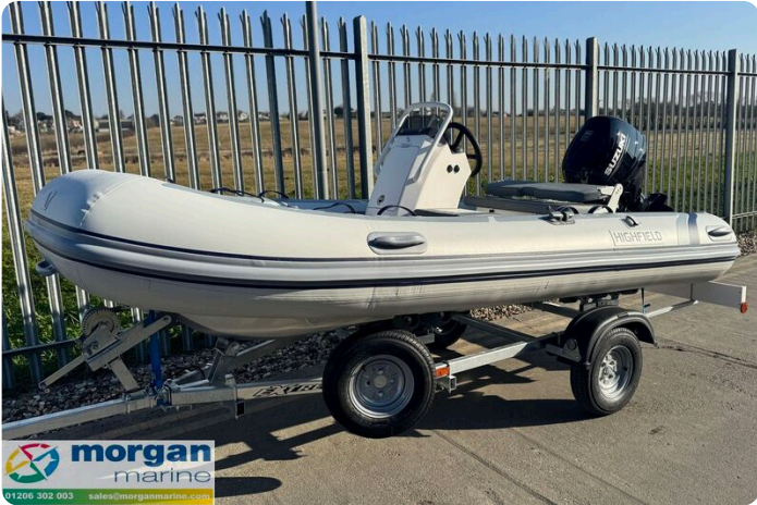
Highfield Classic 380 GT console - Main