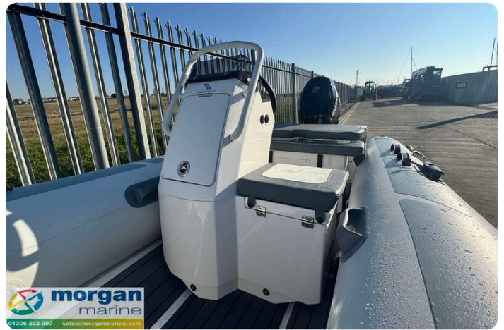
Highfield Classic 380 GT console - GT Console