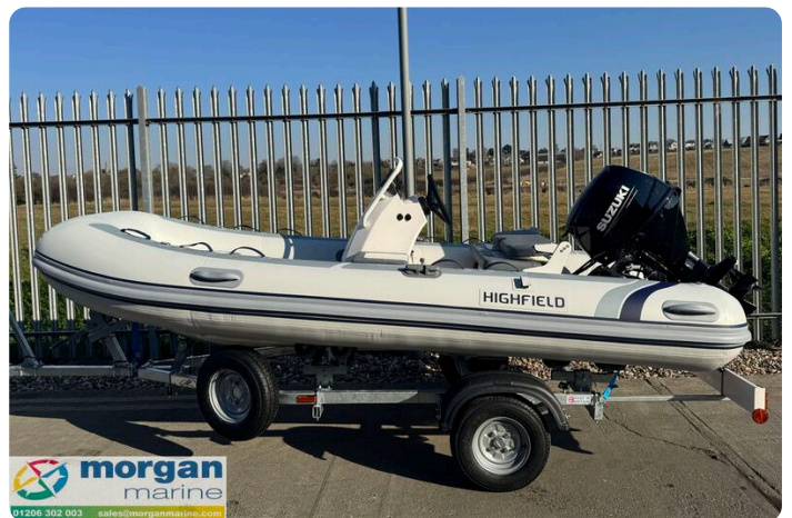
Highfield Classic 380 GT console - side view