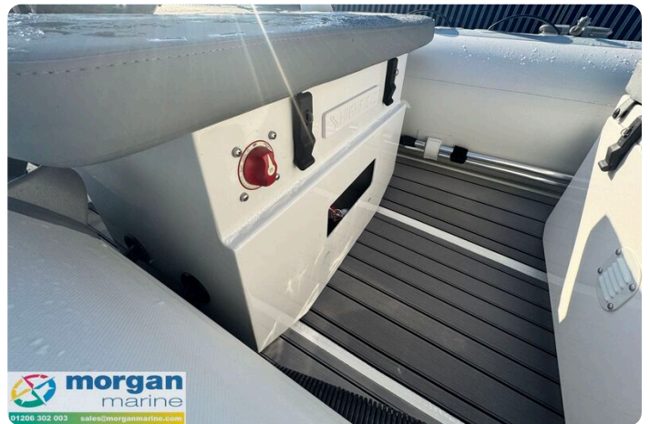
Highfield Classic 380 GT console - isolator