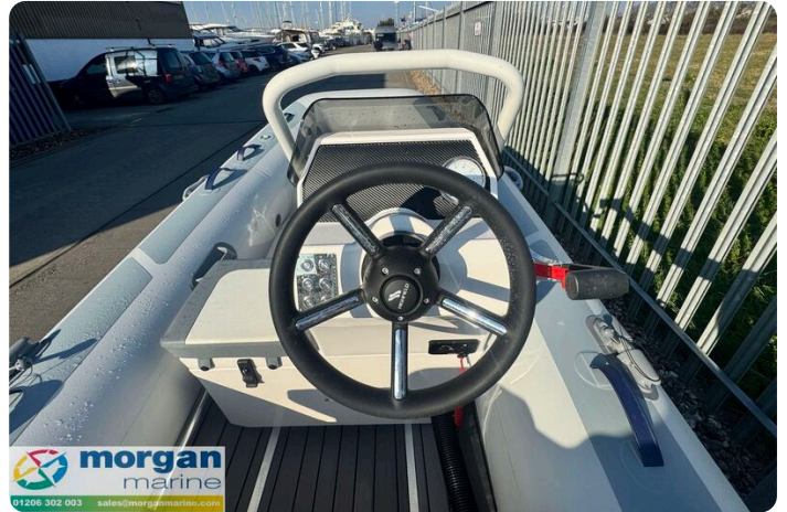
Highfield Classic 380 GT console - Wheel