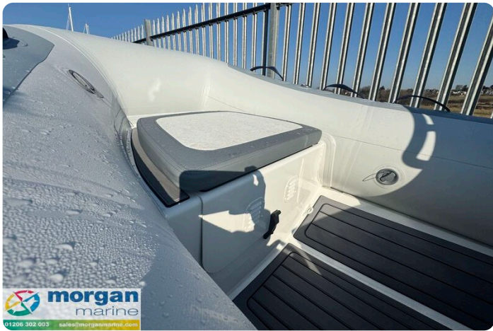
Highfield Classic 380 GT console - bow seat