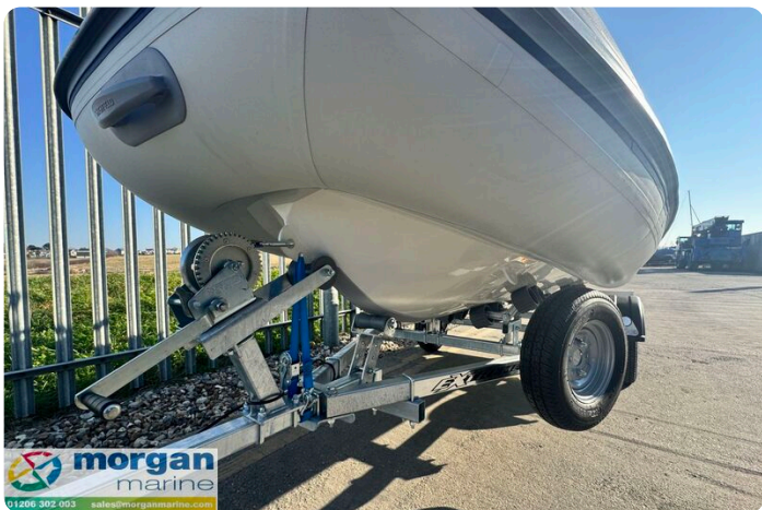
Highfield Classic 380 GT console - bow