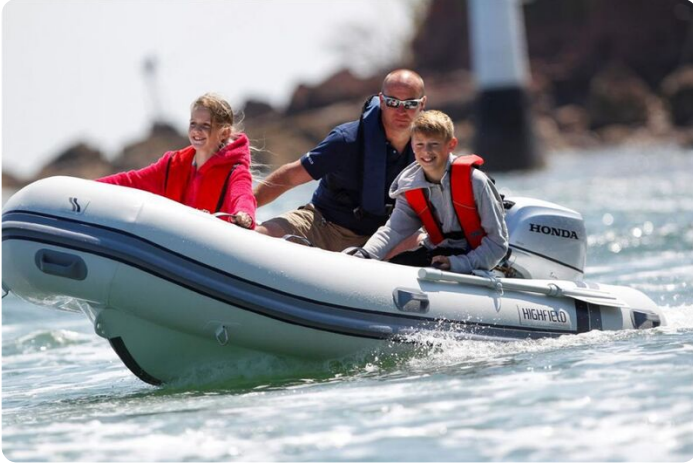
Highfield CL 360 aluminium RIB