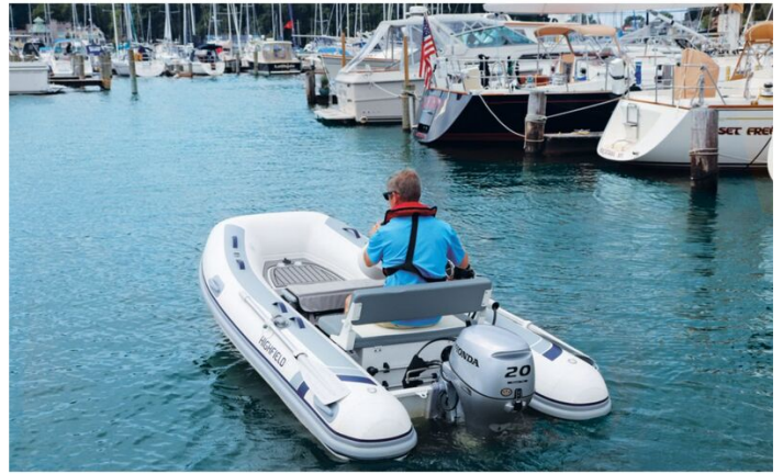
Highfield CL 360 aluminium RIB - along side larger boats