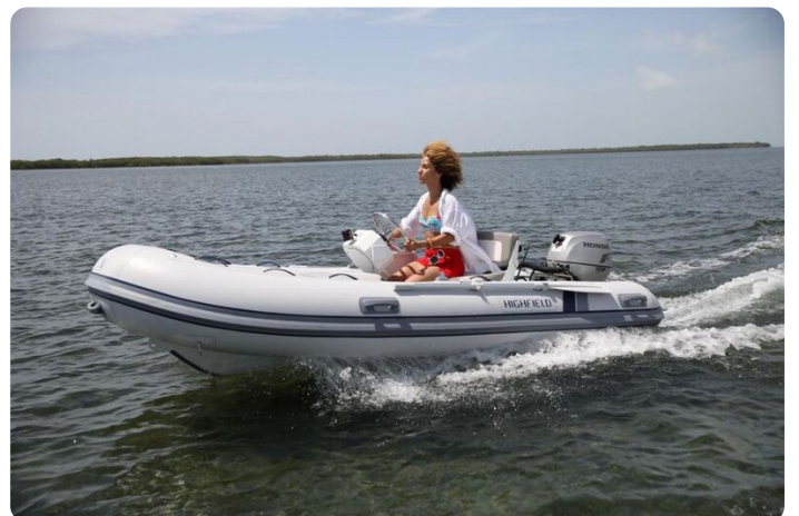
Highfield CL 360 aluminium RIB - on the water