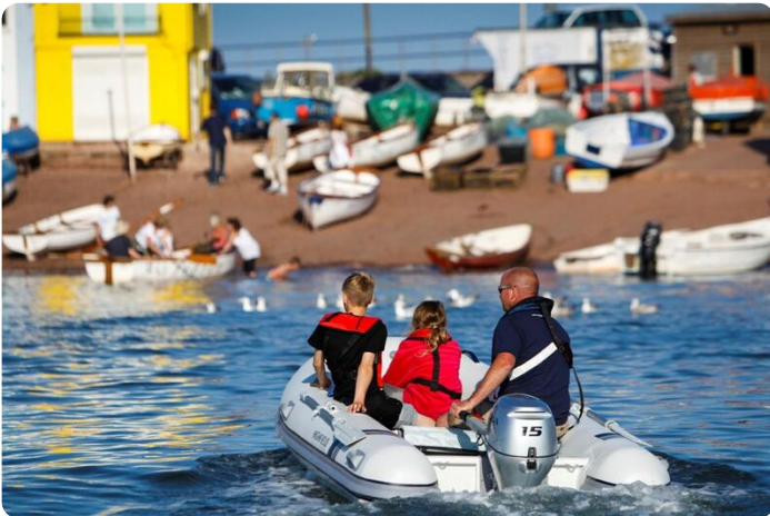
Highfield CL 360 aluminium RIB - and other RIBs on the water