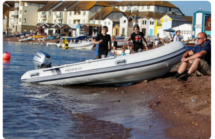
Highfield CL 360 aluminium RIB - port side