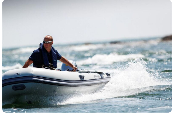
Highfield CL 360 aluminium RIB - view towards bow