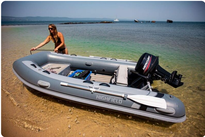
Highfield CL 360 aluminium RIB - on the beach