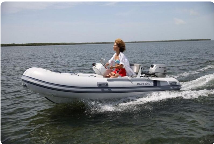
Highfield CL 260 aluminium RIB - on the water