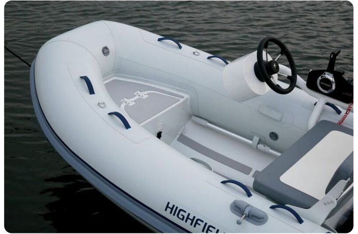
Highfield CL 340 aluminium RIB - bow