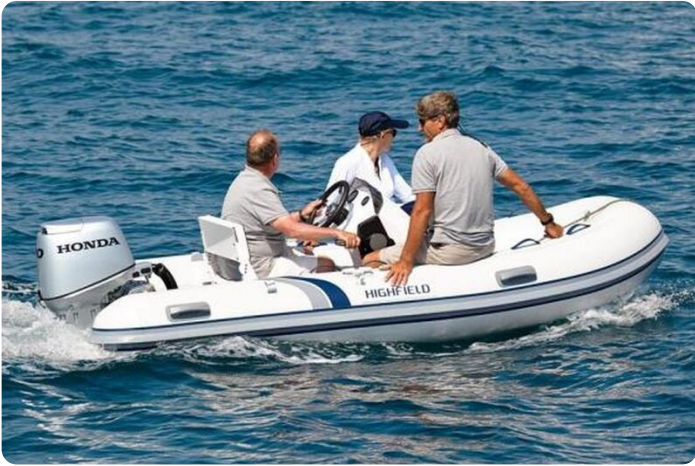
Highfield CL 260 aluminium RIB