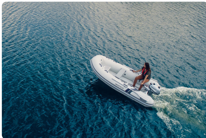
Highfield CL340 aluminium RIB - birdseye view