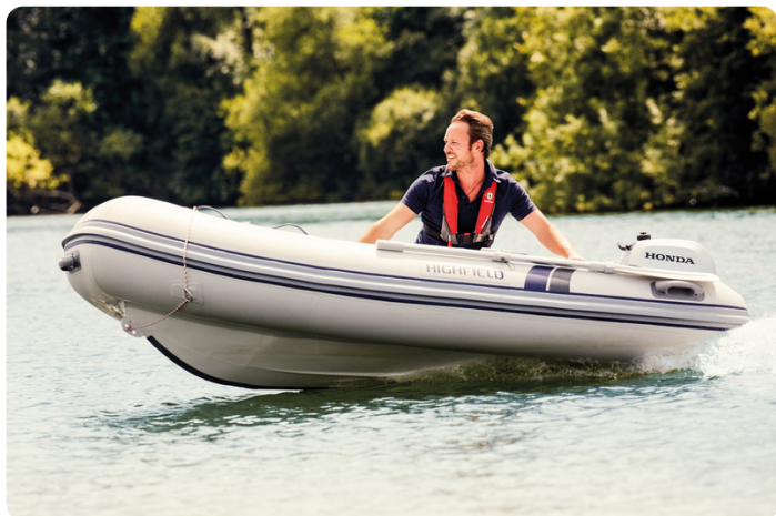
Highfield CL340 aluminium RIB