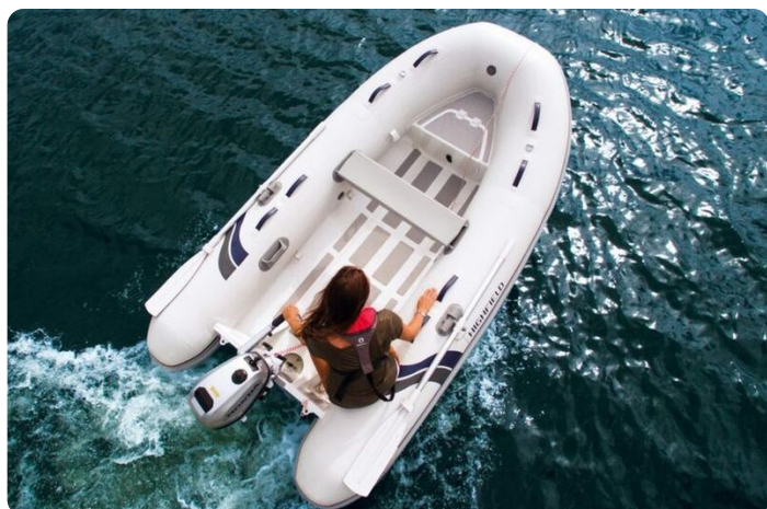
Highfield CL 310 aluminium RIB