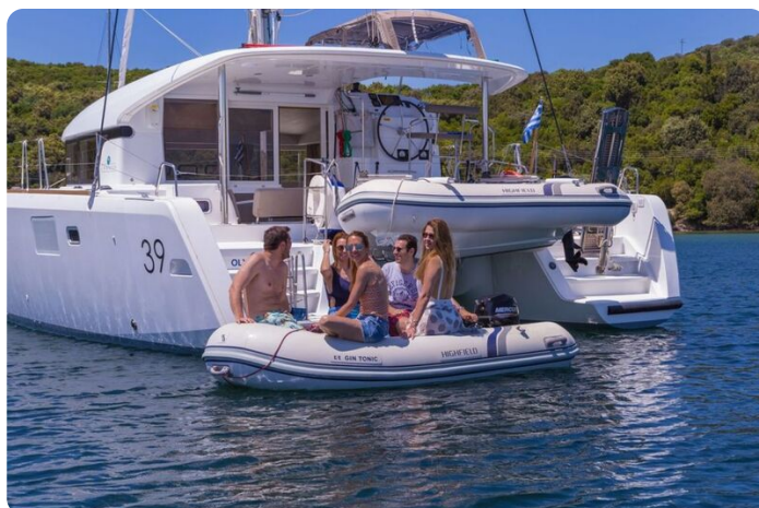
Highfield CL 310 aluminium RIB - tender to larger boat