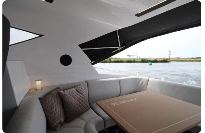
Focus Power 36 HT