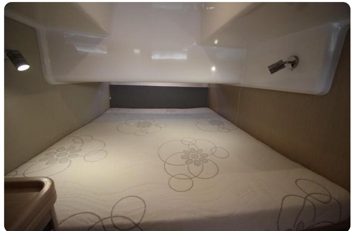
Focus Power 36 HT