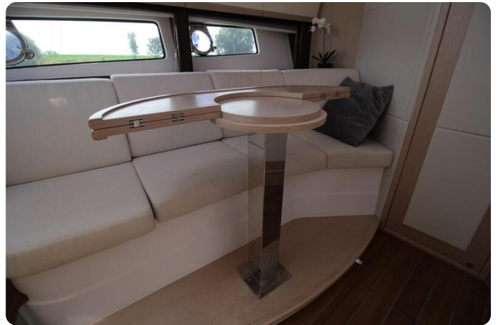
Focus Power 36 HT