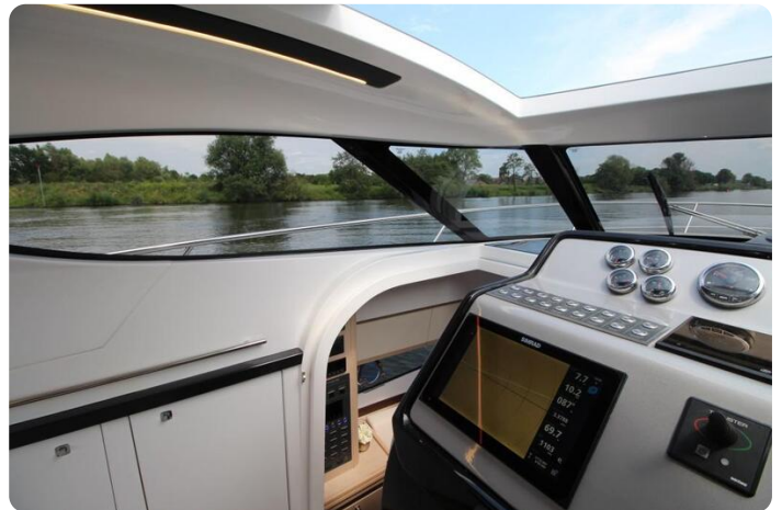
Focus Power 36 HT