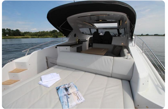
Focus Power 36 HT