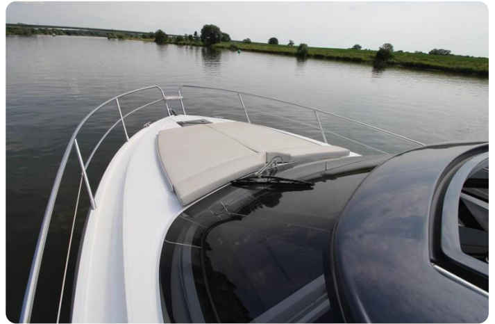
Focus Power 36 HT