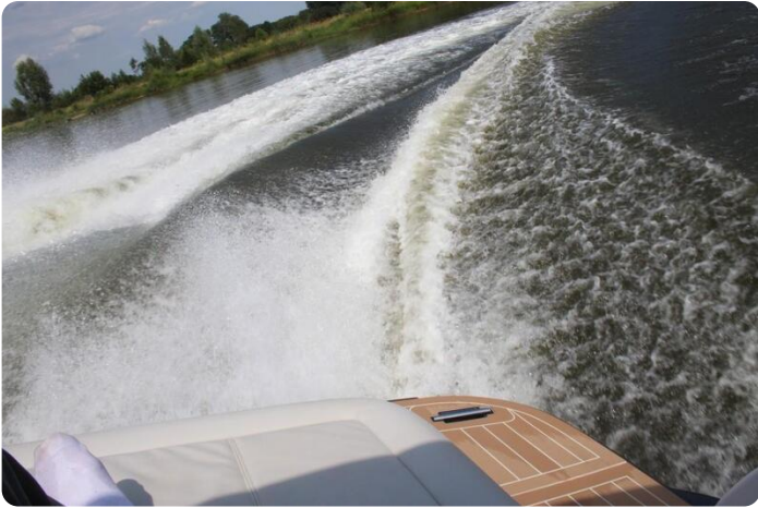
Focus Power 36 HT