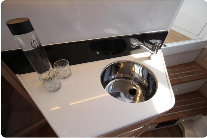
Focus Power 36 HT