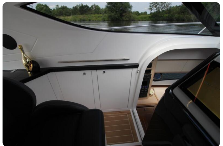
Focus Power 36 HT