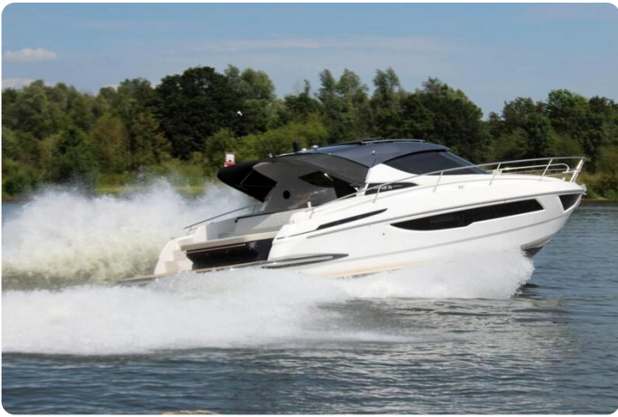
Focus Power 36 HT