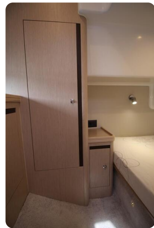
Focus Power 36 HT