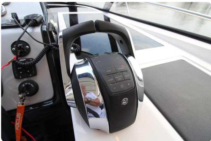
Focus Power 36 HT