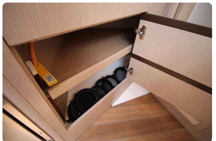
Focus Power 36 HT