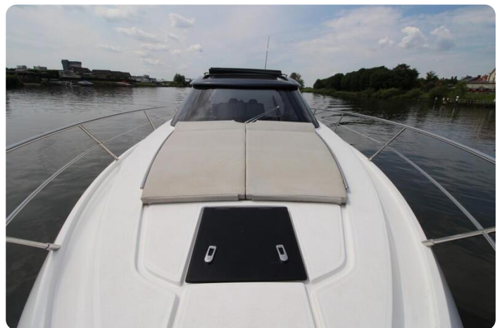
Focus Power 36 HT