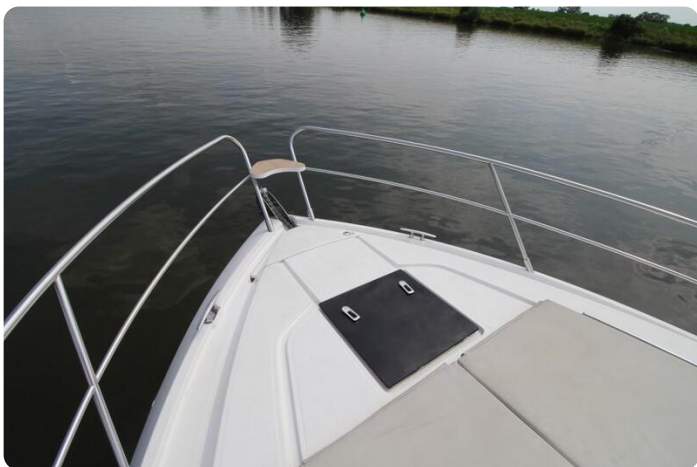
Focus Power 36 HT