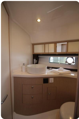
Focus Power 36 HT