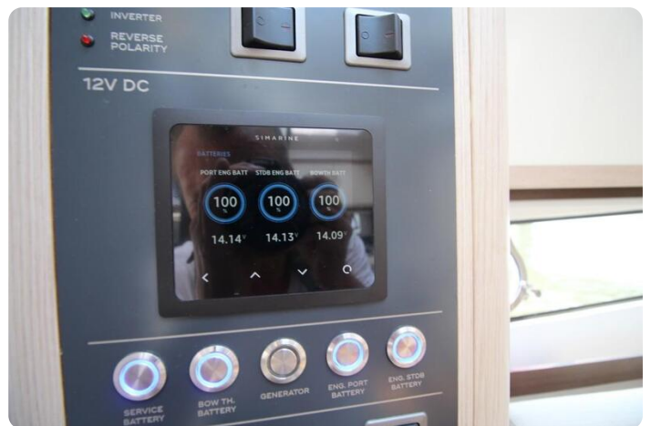
Focus Power 36 HT