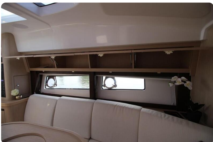
Focus Power 36 HT