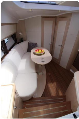
Focus Power 36 HT