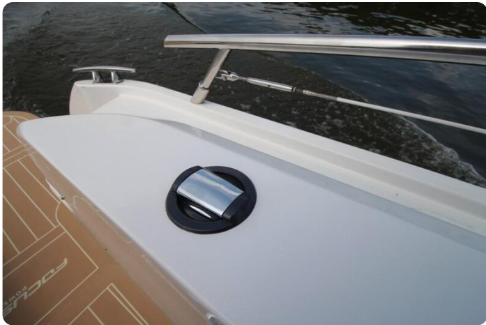
Focus Power 36 HT