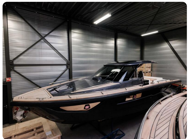
Focus Forza 37