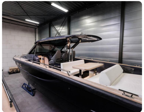
Focus Forza 37