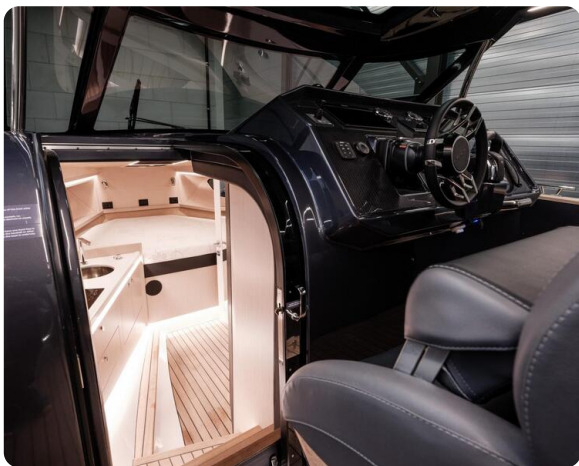
Focus Forza 37