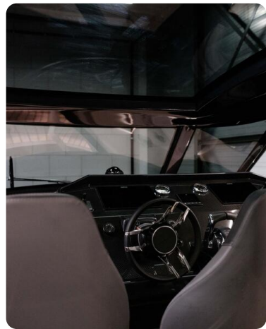
Focus Forza 37