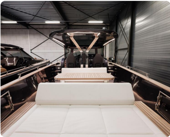
Focus Forza 37