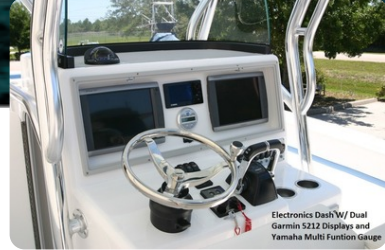
Electronics Dash w/ Dual Garmin 5212 Displays and Yamaha Multi Fuel/Gauge