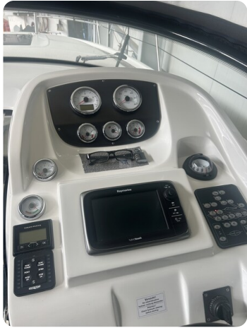
Bav.28 Sport 33