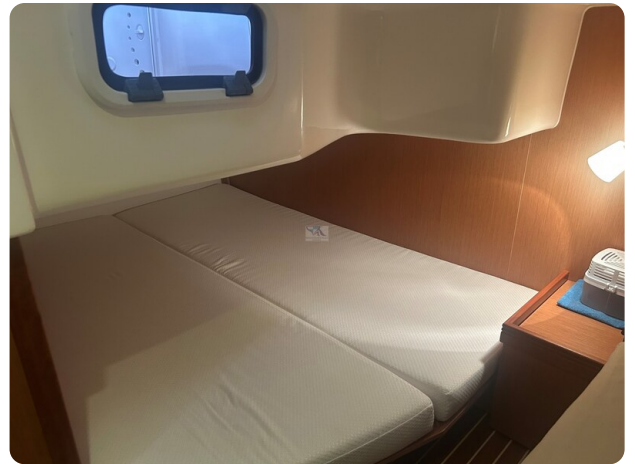
Bav.28 Sport 6