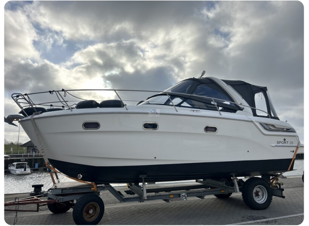
Bav.28 Sport 47