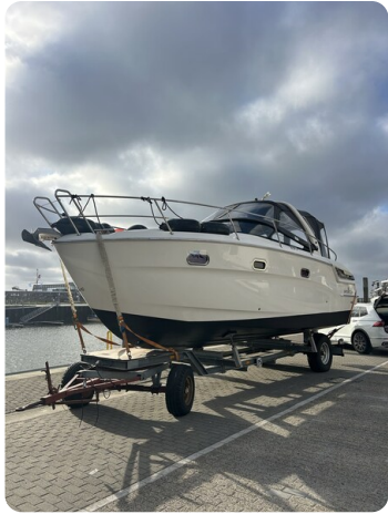
Bav.28 Sport 44