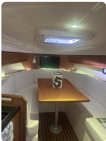
Bav.28 Sport 17