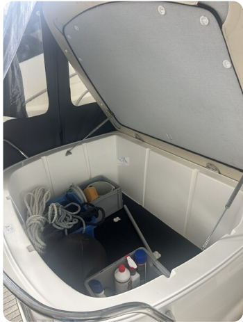
Bav.28 Sport 38