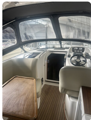
Bav.28 Sport 27