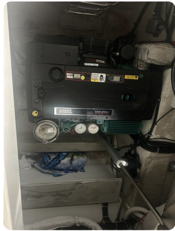
Bav.28 Sport 40