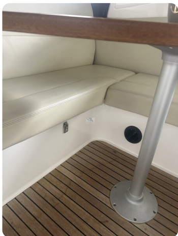
Bav.28 Sport 36