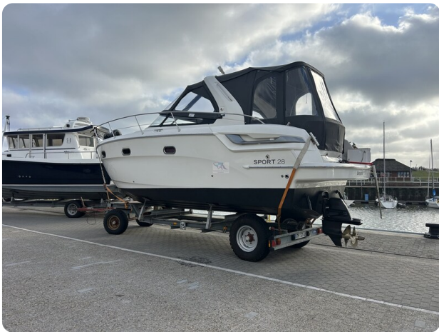
Bav.28 Sport 42