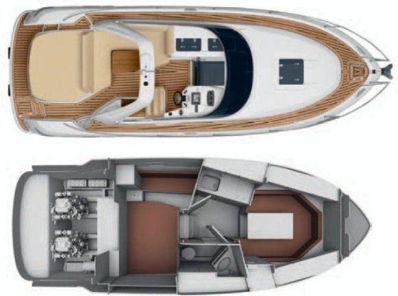
Layout Bav. 28 Sport