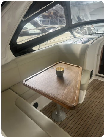
Bav.28 Sport 34