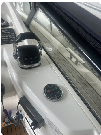
Bav.28 Sport 32