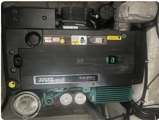
Bav.28 Sport 41