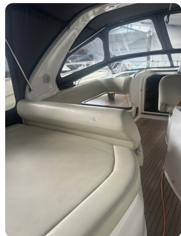
Bav.28 Sport 37