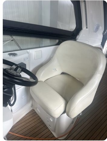
Bav.28 Sport 35