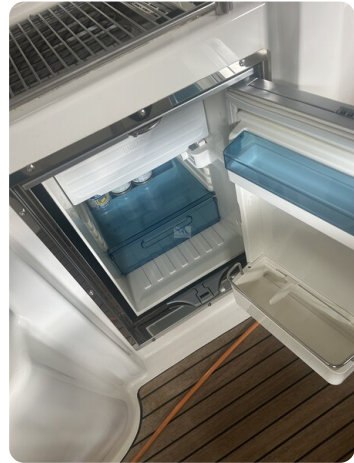
Bav.28 Sport 29