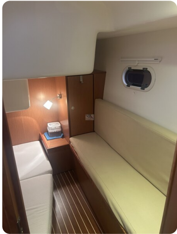
Bav.28 Sport 14