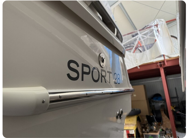
Bav.28 Sport 9