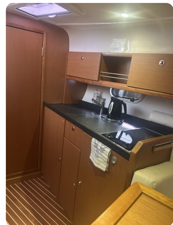
Bav.28 Sport 21