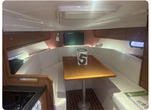
Bav.28 Sport 18