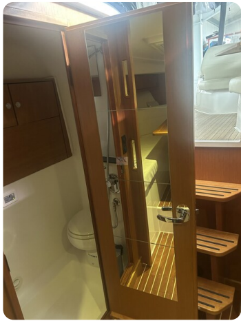
Bav.28 Sport 26