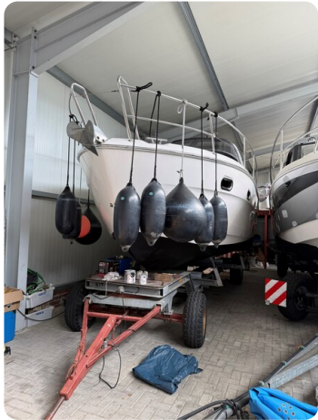
Bav.28 Sport 5